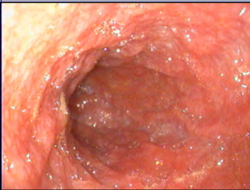
Endoscopic view of the duodenum demonstrating hyperemia, friability and increased granularity. The white lesions represent dilated lymphatics known as lymphangectasia.

By Kenneth A. Arceneaux, DVM, Diplomate ACVIM, MedVet New Orleans